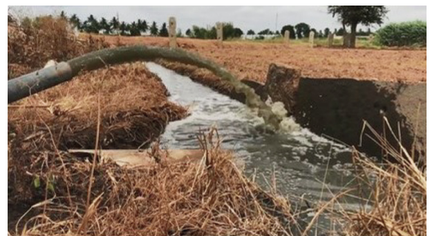
Fig. 2. Highly polluted agricultural wastewater discharged into a river basin [17].

One of the key challenges in addressing virtual water issues, in relation to the acquisition of crops or products in one country having an impact on water pollution in another country, is related to pricing. For example, in the United Kingdom, a domestic consumer uses about 150 L of water per day and is then typically charged about 6 \text{ USD} \cdot \text{m}^{-3} by the local water company. However, while this charge includes the delivery and collection of treated water and wastewater respectively to and from the home, it does not include the cost of virtual water treatment (e.g., in crop production) that would be needed to maintain good ecological status in river basins in other countries. For example, the cost of cotton clothes produced in lower gross domestic product (GDP) countries often does not include the cost of treating the polluted effluent before it is discharged back into the river basin, thereby leading to increased health risks for citizens living downstream of the polluted water source inputs. This begs the question: Should the consumers of products (e.g., cotton clothing) in higher GDP countries pay more for their products to ensure that the water used for crop