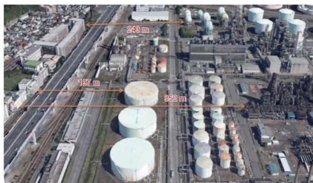
Fig. 2. Distance between Japanese Negishi Refinery and the community.