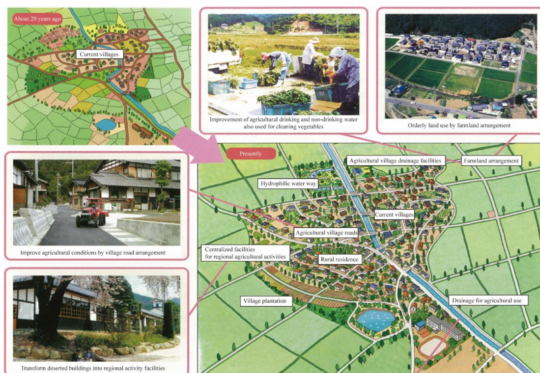
Fig. 3. Japan's rural planning intention.

Conditions: *1 When the land is farmland, there is no substitute land. *2 Approved by the Rural Construction Council. *3 The land use has been positioned in the rural construction plan. *4 The following items must be confirmed according to the plan: (1) For land use, agricultural operation, life, improvement, protection, utilization of natural environment, and protection and formation of rural landscapes in the surrounding areas must be fully taken into account. (2) For setting up accompanying buildings (including structures), the location, scale, and shape of the buildings shall be suitable for the protection and formation of an appealing rural landscape in the surrounding areas. (3) Green space conditions for land use area: a. Proportion of green area and floor area, as shown below: when the floor space is less than 1 hm 2 , the proportion of green space must be more than 10%; when the green area exceeds 1 hm 2 , the proportion of green space must be more than 20%. b. For plant greening, it is necessary to consider the landscape of public places, such as roads. (4) For temporary land use projects, the plan for land restoration after use should be clarified. In this case, the greening arrangement can be separated from the surrounding environment. *5 Land use should be positioned in the rural settlement business plan.