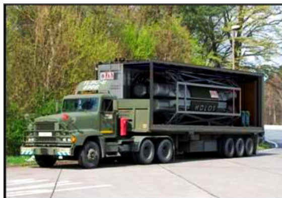
Fig.1. Holos system transport configuration.

Holos is fueled by enriched uranium with 8% enrichment. It can operate for 10 to 20 years with one charge. It is designed in two models [9]: a 3.3 MW model, which can be installed in a 20 ft. (1 ft. = 0.3048 m) ISO transport container; and a 13 MW model, which can be installed in a 40 ft. ISO transport container and the total mass of the system does not exceed 40 t. Holos is designed with a compact overall layout, with an integrated outer envelope of all components within an ISO transport container (Fig. 1), enabling fast, mobile, and safe transportation. The commercial waste/spent fuel disposal storage tank solution can be adopted in the system module to further reduce the decommissioning cost [2]. The system uses the plug-and-play mode and can be directly connected to the power grid.