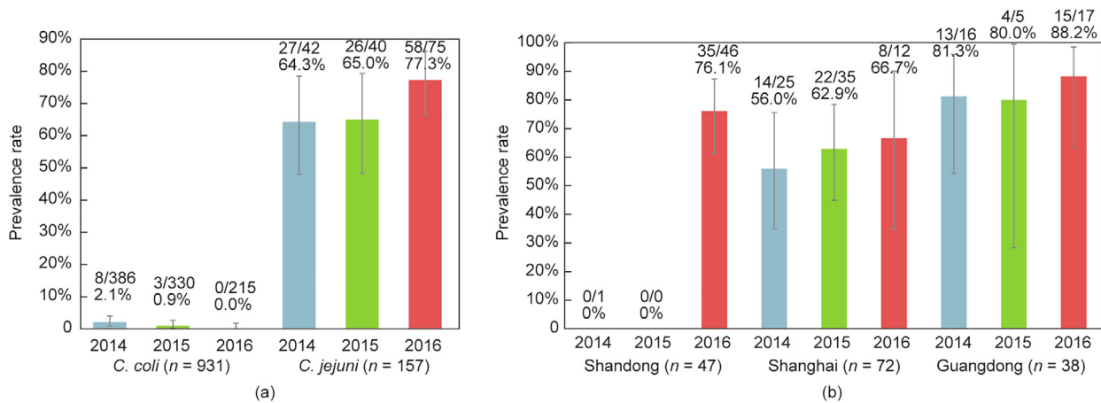
Fig. 1. Prevalence rate of RE-cmeABC-positive isolates from three regions by year. (a) Comparison of RE-cmeABC-positive isolates in C. coli and C. jejuni from the three regions by year; (b) percentage of RE-cmeABC-positive C. jejuni isolates from three regions by year. The error bar represents 95% CI.

because C. jejuni is the dominant species in poultry [26]. Due to the low isolation rate and limited number of RE-cmeABC-positive C. coli , we only compared RE-cmeABC-positive C. jejuni from various regions and years.