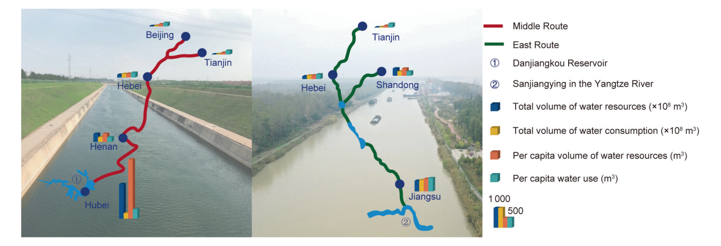
Fig. 1. Sketch map of the Middle and East Routes of the SNWD Project. The background figures used the site photos of the Middle Route (left) and East Route (right). The total volume of water sources (blue bar), total volume of water consumption (yellow bar), per capita volume of water resources (orange bar), and per capita water use (turquoise bar) for each province and city were calculated based on data from the China Water Resources Bulletin 2020 and Chinese Census 2020 .

Water withdrawals from the donor basin may decrease the discharge and sediment transportation in downstream rivers [25]. The