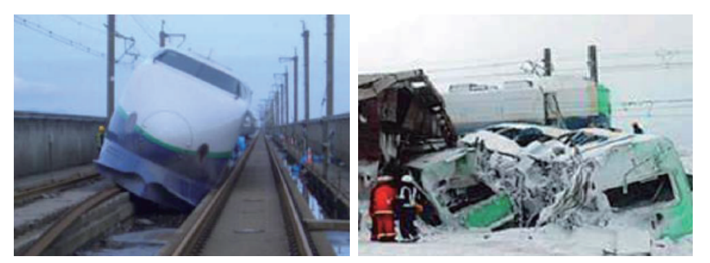
Fig. 1. Derailment of high-speed Shinkansen trains caused by earthquake (left) and snowstorm (right) [2].