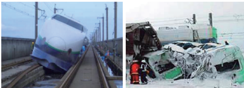
Fig. 1. Derailment of high-speed Shinkansen trains caused by earthquake (left) and snowstorm (right) [2].