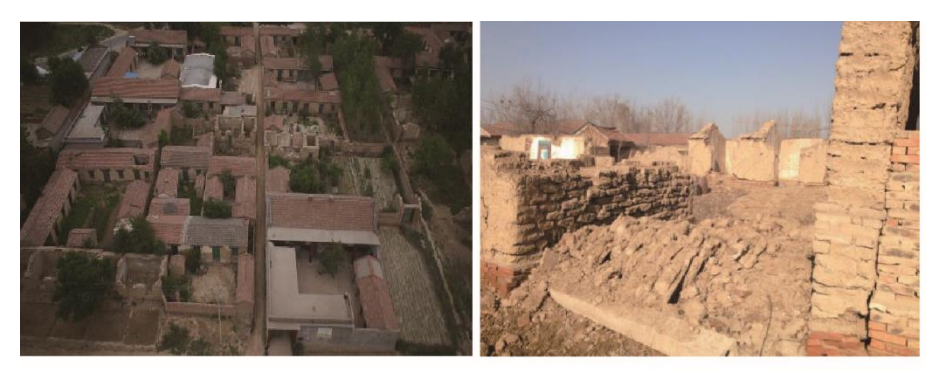
(a) Aerial photos of idle and abandoned house sites of Yangqiao Village

soil layer reformulation, and soil texture improvement for the area. The first layer was filled with abandoned bricks, tiles, concrete blocks, and other construction waste arising from the demolition of "hollowing villages," with a filling depth of 0.3 m and is then grounded six times by a crawler excavator. The second layer is filled with wall soil, courtyard soil, and other rural soil with fewer stones and bricks to a filling depth of 0.35m. The third layer consists of four types of matter based on different soil layer reformulation plans, namely courtyard soil, reformulation of courtyard soil and swag sediment, reformulation of courtyard soil and sand, and reformulation of saline-alkali soil and sand, and has a filling depth of 0.35 m. Reclaimed cultivated land and original cultivated land are converted into agricultural enterprises in a unified manner to realize scale operation. While earning rent, peasant households are freed from agricultural production and can continue to engage in non-agricultural production for a higher income (Fig. 1).