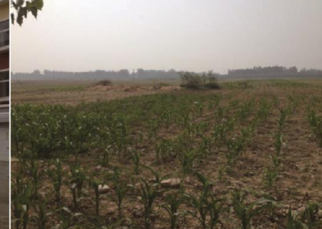
(c) New-type residential community(d) Reclamation of house sites to cultivated landFig. 1. Comprehensive consolidation project of hollowing villages of Yangqiao community.

The core of the land consolidation of "hollowing villages" lies in the replacement of land use and optimization of the spatial pattern. When it comes to functional orientation, the construction of Yangqiao Community reinforces the fact that one instance of consolidation can deliver returns in three ways when assessed as part of overall planning of urban-rural land use in the region. Land is increased by village consolidation, returning village land to farmland, forest, and garden (construction) through village land consolidation [23]. In addition, the construction of Yangqiao Community took into consideration the lives of residents, agricultural production, and the ecological environment. As a result of this new type of community construction and reclamation of house sites to farmland, the sweeping consolidation project of "hollowing villages" has not only vitalized idle land resources of villages, but also optimized spatial patterns of villages, revamping production, living, and ecological spaces.