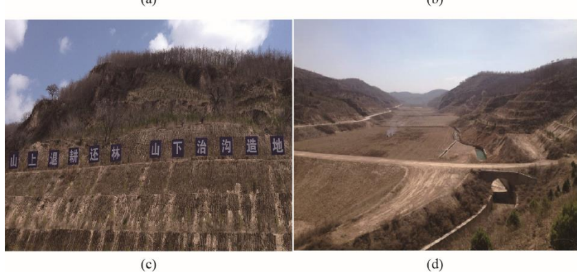
Fig. 2. Key ditch governance and land reclamation project of loess plateau.