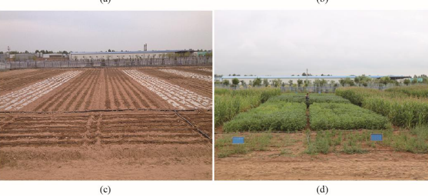
Fig. 3. Test station of Yulin modern agriculture dual-optimization project.