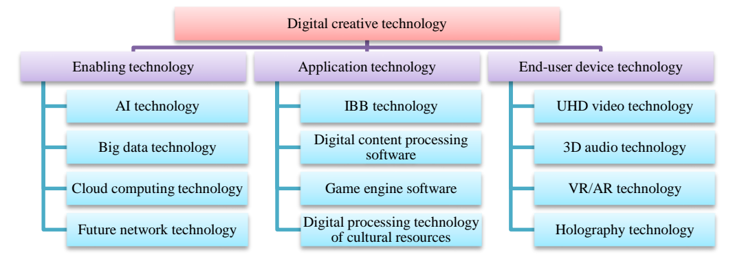
Fig. 1. Digital creative technology classification introduced in this article.

Previous papers have described some of these technical fields, including AI technology [3], big data technology [4], cloud computing technology [5], UHD video technology [6], and VR technology [7]. However, to the best of our knowledge, no studies have systematically and comprehensively introduced the field of digital creative technology in China. Meanwhile, most existing papers have described general technologies, but have not emphasized the role of these technologies in the digital creativity industry. To this end, in the present study, key technology sub-fields were selected and the development of digital creative technology in China is introduced in detail herein. Specifically, we will introduce enabling technologies, including artificial intelligence, big data, cloud computing, and future network technologies; application technologies including IBB, digital content processing, game engine software, and digital processing technologies for cultural resources; and end-user device technologies, including 4K/ 8K UHD video, 3D audio, VR/AR, and holography technologies, as shown in Fig. 1.