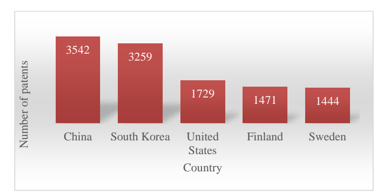
Fig. 2. Number of 5G standard patents declared by various countries according to the European Telecommunication Standardization Association (as of December 28, 2018) [14].

5G technology is a representative future network technology. According to the "Global Race to 5G" report released by the Cellular Telecommunications Industry Association (CTIA) in April 2019, China and the United States ranked first in the world in the number of 5G commercial deployment plans [13]. In terms of the number of required patents for 5G standards (Fig. 2), the total number of patent declarations of three companies in China is 3542, accounting for 30.3% of the total declarations, ranking first. The 5G R&D in China has been recognized as a leading echelon globally.