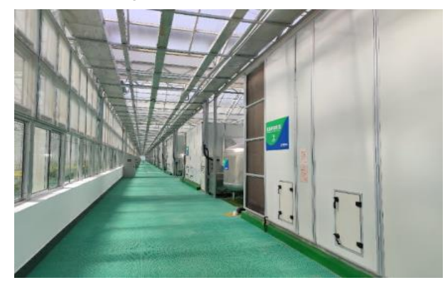
Fig. 2. Greenhouse environment integrated control system based on positive pressure ventilation.

forming intelligent operation technology equipment covering the application of the entire industrial chain, such as crop seedling robots, logistics robots, plant protection robots, harvesting robots, postharvest treatment equipment, and agricultural waste treatment robots. By integrating mechanical, electronic, control, and other technologies, we can develop biosensor equipment for real-time monitoring of plant physiological and ecological characteristics, maximize access to plant growth demand information, reduce human impact, and comprehensively carry out scientific production and information management [13].