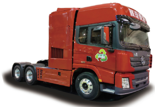
Fig. 2. A typical hydrogen storage system layout of a fuel cell heavy-duty truck.

filling speed is 60 \text{ g}\cdot\text{s}^{-1} . For heavy-duty hydrogen trucks with a large hydrogen storage capacity, this filling time is too long to meet operational efficiency. For example, Nikola proposes to achieve a filling target of 80 kg within 15 min, and the US DOE aims to achieve a filling rate of 8 \text{ kg}\cdot\text{min}^{-1} by 2030. As hydrogen storage technology continues to mature and the means of process monitoring improve, filling speed will increase significantly.