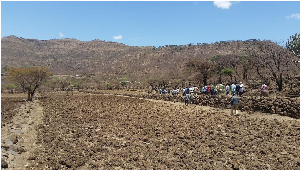
Fig. 2 Integrated sustainable land management program (SLMP) and Integrated Soil Fertility Management Project (ISFM + ) intervention along the landscape (area closure in the upper, and stone bunds and integrated soil fertility management in the middle and lower catchment areas) in Tigray region (© Gerba Leta, 11:35 A.M., April 19, 2019).

In participatory extension, farmers tend to support each other; that is, a group of 15–20 farmers collectively investigate, learn and act together. Such collective action not only facilitates learning but also enhances knowledge transfer and scaling of the tested technology. FREGs often conduct new technology trials for wider adoption and upscaling. Proper and practical application of technology boosts its rate of adoption. The ISFM + experiences have shown that successful outcomes of pilot activities and strong groups have encouraged more farmers to join the FREG. For instance, the FREG membership for watershed activities has increased from 50 to 60 farmers in 1 to 2 years in the Seglame kebele of Lay-Lay Machew woreda in Tigray region and in the Ale-Buya kebele in Mattu woreda in Oromia region.