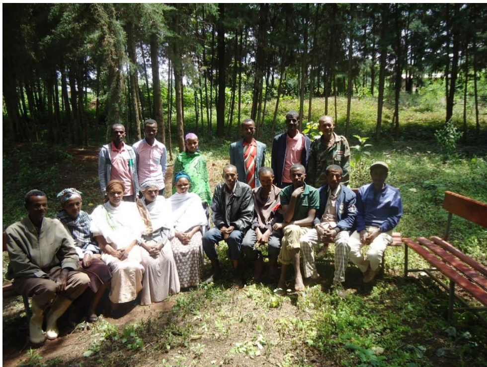
Fig. 1 A farmer focus group discussion in the Darbas-Gerado kebele of Gudeya-Bila woreda (© Gerba Leta, 8:38 A.M., June 20, 2019).

thematic analysis and interpretation of various ISFM + activities [19] .