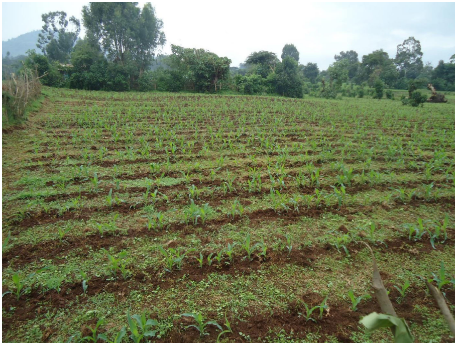
Fig. 5 Line seeding of maize using small-scale mechanization on a smallholder farm in Agalo-Gidami kebele (8:38 A.M., June 10, 2019).

Given that ISFM + integrates diverse technologies and practices, the availability of resources for investment is essential. However, high initial cost can dissuade resource-poor farmers from adopting the technology/practice, even though a cost-benefit analysis may confirm the benefits of