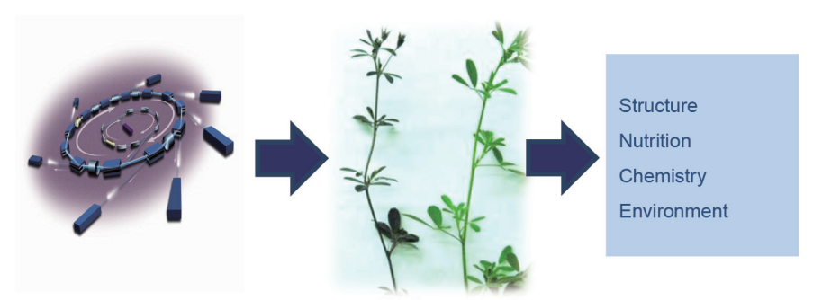
Fig. 1. Advanced synchrotron-based bioanalytical technology can provide four kinds of information simultaneously, including tissue structure, tissue nutrition, tissue chemistry, and tissue environment.

subcellular dimensions in animal feeds, which are associated with nutrient delivery in animals [15,16]. Along with other factors such as the nutrient matrix, the inherent molecular structure and makeup of a feed affects feed quality, nutritive value, biofunction, fermentation behavior, degradation kinetics, and digestion in animals [12,17]. The feed molecular structure conformation or structural makeup strongly impacts the protein that is absorbed in the small intestine, and strongly impacts the protein's accessibility to internal digestive enzymes in the animal gastrointestinal tract [18,19]. Reduced accessibility to internal digestive enzymes causes poor digestion and poor absorption, and thus results in poor protein nutritive value in animals [20–22].