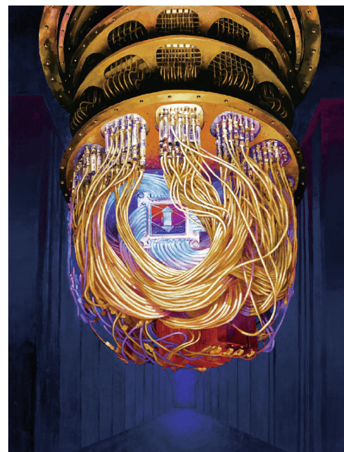
Fig. 1. Artist's rendition of Google's Sycamore processor embedded in a cryostat device that cools the processor's qubits to a fraction of a degree above absolute zero. The low temperature helps prevent noise from disrupting the qubits. Credit: Forest Stearns, Google AI Quantum Artist in Residence (CC BY-ND 4.0).

Google built its quantum computer by stringing together qubits made of loops of superconducting metal shielded from the noisy non-quantum world in a chamber kept at temperatures just above absolute zero (Fig. 1). Google's recent breakthrough experiment