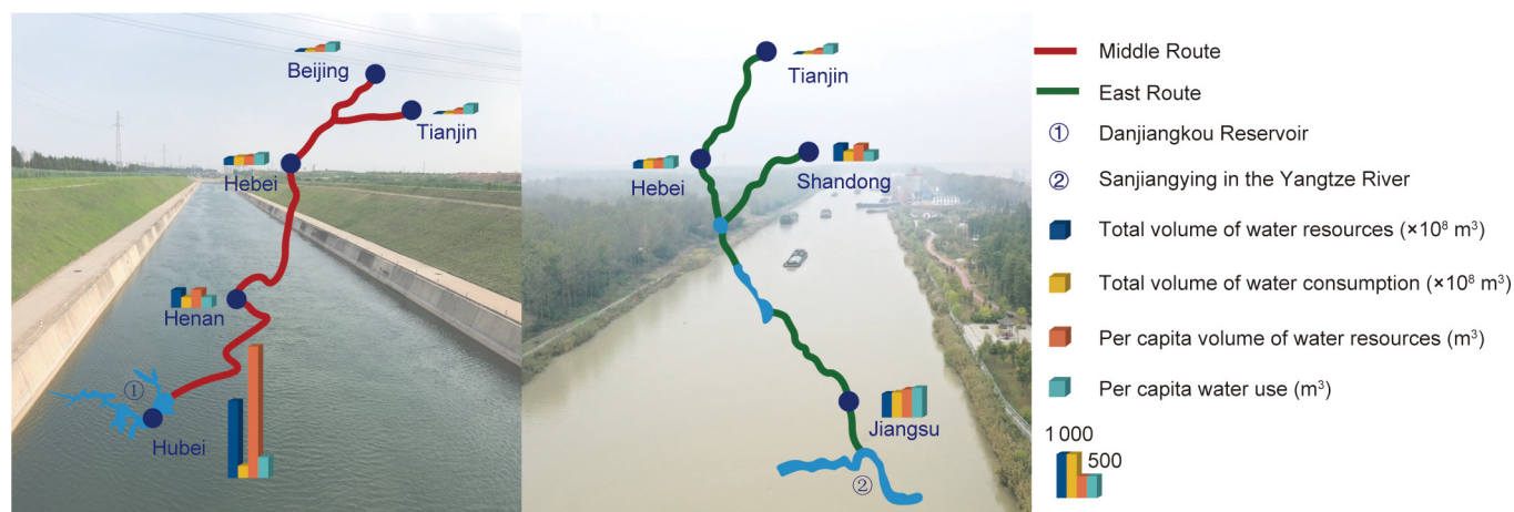
Fig. 1. Sketch map of the Middle and East Routes of the SNWD Project. The background figures used the site photos of the Middle Route (left) and East Route (right). The total volume of water sources (blue bar), total volume of water consumption (yellow bar), per capita volume of water resources (orange bar), and per capita water use (turquoise bar) for each province and city were calculated based on data from the China Water Resources Bulletin 2020 and Chinese Census 2020 .

Water withdrawals from the donor basin may decrease the discharge and sediment transportation in downstream rivers [25]. The