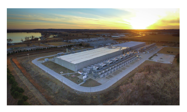
Fig. 2. Large, cloud-accessed data centers like this one built and operated by Google in Council Bluffs, IA, USA, can draw more than 100 MW at any given time—consuming roughly as much electricity as 80 000 homes—and have cooling systems that can guzzle up to 3 \times 10^9 L of water a year. Google claims that all its data centers will be running entirely on renewable energy by 2030.

The environmental toll of AI goes beyond energy. Building data centers and manufacturing computer chips and servers produces greenhouse gases, for instance, and obtaining the raw materials for the electronics entails environmentally damaging mining [25]. Using data from Facebook (Menlo Park, CA, USA), Lee and colleagues estimated in a 2022 report that this so-called embodied carbon (all greenhouse gas emissions not directly connected to data center operation) accounts for between 30% and 70% of the total carbon footprint of certain AI models [26]. And as one article cheekily commented, AI has "a drinking problem," with data centers requiring large amounts of water to keep cool [27,28]. Ren said that he and his team were the first to try to estimate AI's water use. Starting with Microsoft's reported annual water consumption, they estimated that GPT-3-which trained on Microsoft's cloud computing platform-needed about half a liter of water every time it answered from 20 to 50 user questions [29]. ChatGPT Plus, Open-AI's updated, faster, and more versatile chatbot that costs 20 USD per month, now relies on an even larger AI model, GPT-4, which is likely to be thirstier. So "overall, our estimate is conservative," Ren said. Given the 180 million-plus monthly visitors to the ChatGPT website [1], its water consumption could quickly add up to a substantial amount.