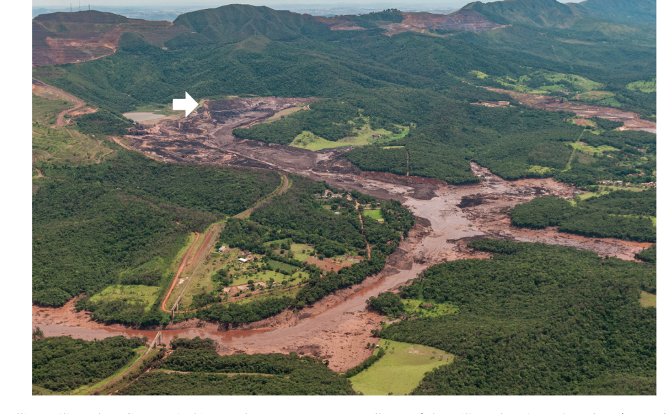
Fig. 1. In one of the deadliest tailings dam disasters in history, the 25 January 2019 collapse of the tailings dam (arrow) at the Córrego do Feijão iron ore mine near Brumadinho, Brazil, sent a wave of toxic mud downstream, killing 237 people and destroying 269.84 hm<sup>2</sup> of land.

Multiple factors can contribute to tailings dam failures. The contents can leak out slowly, earthquakes can rock the dam and its foundations, and filling the reservoir too quickly can lead to overtopping and problematic maintenance, resulting in a build-up of excess water. Sound engineering design is not enough; analysis of case histories has pointed to poor management and operational strategies as also being factors that can lead to dam failure [5]. Following the Brumadinho dam disaster, the Brazilian authorities banned upstream dams in the country and have embarked on an investigation to determine why the dam had failed, only months after it had been declared safe [5]. It has been reported that complaints by company employees of unsafe conditions went unheeded in the months prior to the failure [6].