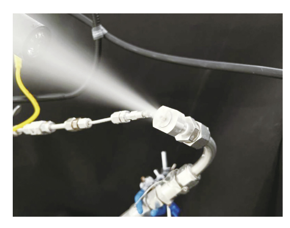
Fig. 3. The customized spray nozzle used in the MCB field test produces a high output of very small (~50 nm dry diameter) sea salt particles by creating a high-pressure two-phase flow mixture inside a small cavity and then ejecting the air and liquid droplets in a way that avoids the immediate collision and growth of particles to larger sizes.

The size of the ejected particles is crucial for MCB. A cloud that consists of large numbers of smaller water droplets (created by smaller CNNs) reflects more than an otherwise similar cloud made up of larger droplets—a phenomenon known as the Twomey effect [9]. The MCBP team has determined that the spray system must create seawater droplets that will dry to salt crystals ranging from 30 to 100 nm in diameter [10]. Particles smaller than that will not act as CNN, and ones slightly larger would still work but less efficiently. "Anything significantly larger and you can actually induce precipitation in the clouds, resulting in cloud dimming as you lose water," Doherty said.