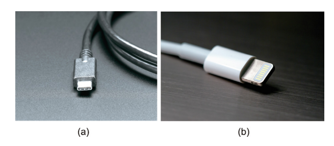
Fig. 1. (a) USB-C cables can transmit data at USB 4.0 speed, as fast as 60 Gbps. By comparison, (b) Apple's lightning cables support USB 2.0 and transmit data at a much slower rate of 480 Mbps. As for charging specs, the lightning cable supports fast charging on the iPhone 13 at 20 W. In contrast, USB-C cables with USB 4.0 specifications can support fast charging up to 240 W. Both connections have reversible ends, making them relatively easy to plug into devices, and they also include chips that help guarantee compatibility and control the power supply to ensure the stability of current and data transfers. Credit: (a) Flickr (CC BY-NC-SA-2.0); (b) Flickr (CC BY 2.0).

However, not all USB-C cables are built the same [9], with many omitting several lines or components necessary to enable all functions, and not all are built to USB 4.0 specifications. The new EU rules fail to stipulate anything about the data-handling capabilities of USB-C cables sold in the region. Apple had already achieved USB-C's universality and reversibility benefits with its lightning connector that is used in all current iPhones and base model iPads (Fig. 1(b)). There are now more than one billion iPhones in the world [10], and every model of iPhone released since 2012 has come with a lightning port.