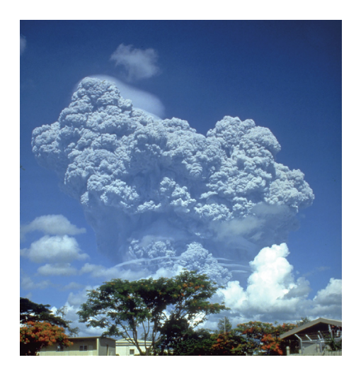
Fig. 3. The 1991 eruption of Mount Pinatabu in the Philippines injected about 13.6 million tonnes of SO<sub>2</sub> into the stratosphere and led to a drop in the average global temperature of about 0.6 °C, inspiring some current solar geoengineering efforts.

United Kingdom led a test run of a recoverable balloon system designed for geoengineering [11]. While these commercially driven tests were met with much criticism, Wagner said the time has come for more tempered research to move from the lab to the field.