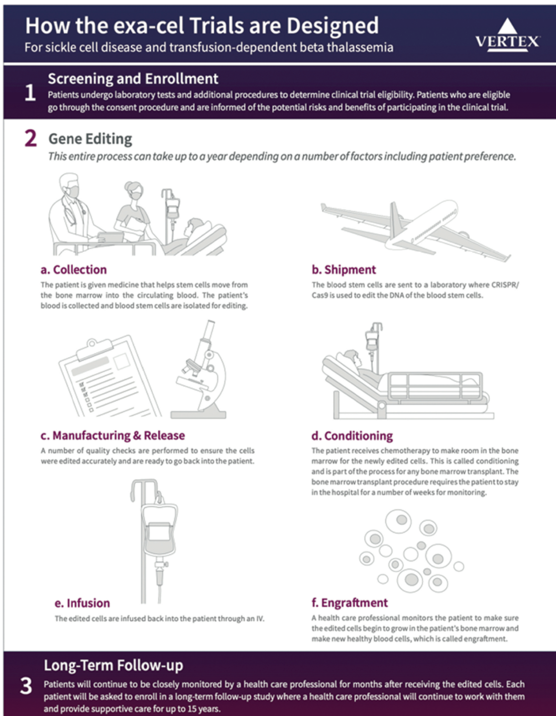
Fig. 3. As shown in this schematic of the clinical trial design, exa-cel therapy, which can take up to a year to complete, involves an ex-vivo procedure where the patient's HSPCs are removed and sent to a laboratory for gene editing using CRISPR/Cas9 and a single-guide RNA molecule to introduce a deletion in the BCL11A repressor gene. After the patient's bone marrow has been ablated by chemotherapy, as in a typical BMT, the edited cells are infused back into the patient. In a matter of weeks, the engrafted cells multiply and begin making RBCs with fetal hemoglobin.

severe SCD [19]. Other estimates of lifetime costs for the treatment of a single patient with severe SCD in the United States run between 4 million and 6 million USD [20]. Given the price tags of other gene therapies, exa-cel will likely cost more than 2 million USD [21], perhaps as much or more than 3 million USD, Porteus said. As of September 2023, Vertex had yet to announce a price.