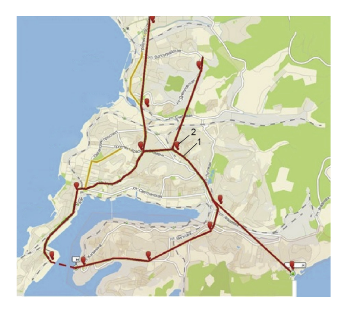
Fig. 1. The radial-ring circuit project for a road tunnel system in the city of Vladivostok. (1) Tunnels; (2) underground parking lots.

Emissions from motor transport were 2.015 \times 10^5 t in 2011 (i.e., 47.25% of the total volume of emissions in the region) [7]. The concentration of exhaust fumes at traffic signals and in residential areas is especially high. At peak times at locations such as crossroads, traffic jams form, cars consume oxygen, and the aerosphere is saturated with exhaust fumes. In the city of Vladivostok, rush hours occur in the morning, when adults leave for work and take their children to school or daycare, and in the evening, when they return home.