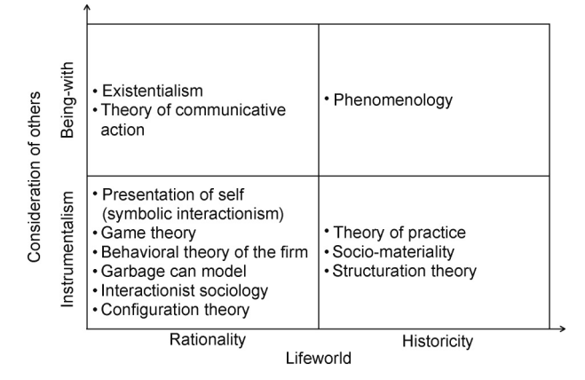
Fig. 2. Theories related to each configuration of the framework.