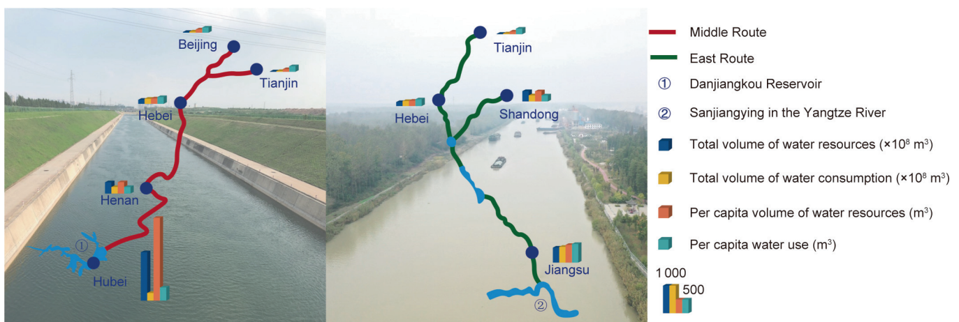
Fig. 1. Sketch map of the Middle and East Routes of the SNWD Project. The background figures used the site photos of the Middle Route (left) and East Route (right). The total volume of water sources (blue bar), total volume of water consumption (yellow bar), per capita volume of water resources (orange bar), and per capita water use (turquoise bar) for each province and city were calculated based on data from the China Water Resources Bulletin 2020 and Chinese Census 2020 .

Water withdrawals from the donor basin may decrease the discharge and sediment transportation in downstream rivers [25]. The