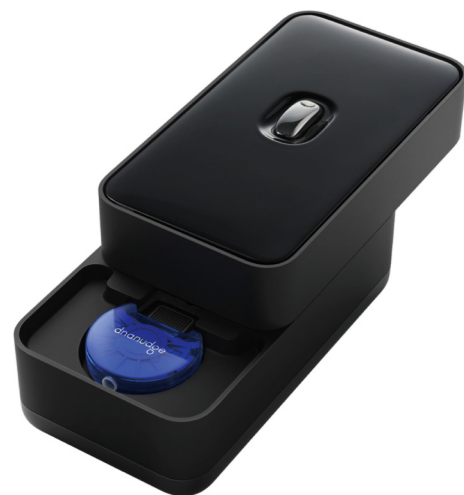
Fig. 2. The CovidNudge test showcases recent innovation in RT-PCR, the healthcare industry gold standard for detecting viral infections. When the top of the toaster-size “DnaNudge” testing instrument is slid into operating position over its bottom, the automated device conducts the complex genetics-based RT-PCR process on patient samples in the removable blue cartridge. Prior to the pandemic, DnaNudge’s engineer-inventors at the Imperial College of London were already miniaturizing such clinical-laboratory-type equipment to speed up and make portable genetic analyses for a consumer-nutrition startup company. Repurposed to diagnose COVID-19 in healthcare settings and non-laboratory sites such as airports, schools, and large workplaces, the device carries out full RT-PCR for SARS-CoV-2 in less than 90 min, roughly a quarter of the time typically required by standard centralized laboratories and without the delays associated with sample transport.

The increasing availability of rapid testing options is “a very positive advancement,” but still “a work in progress,” said infectious disease epidemiologist Maria van Kerkhove, the World Health Organization’s technical lead for COVID-19 and an honorary lecturer at the Imperial College of London School of Public Health. “Countries are using them, so we are trying to provide guidance on where they perform better, to alleviate some of the pressure on PCR.”