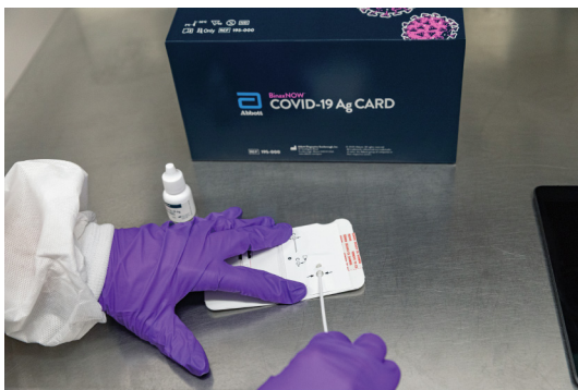
Fig. 1. A healthcare professional inserts a patient’s nasopharyngeal swab into a BinaxNOW card to be tested for infection by severe acute respiratory syndrome coronavirus 2 (SARS-CoV-2), the virus causing the global COVID-19 pandemic. This sort of inexpensive (5 USD), compact device detects protein fragments (antigens) that are unique to the virus in a person’s mucous or other bodily fluids in about 15 min. An order last summer by the US government for 150 million of these novel test cards from the manufacturer, Abbott, has helped vault this and other antigen tests to the forefront of US and international efforts to quell the pandemic.

As of early November 2020, the COVID-19 Testing Commons, a public database maintained at ASU by Aspinall and others [4], listed about 1000 tests available or in development worldwide for detecting active SARS-CoV-2 infections, plus another 1000 antibody tests, used to identify individuals who have had COVID-19 but not those with active infections. The bulk of the database entries for active infection tests, about 75%, fall into the RT-PCR category, mostly variations on that laboratory standard that speed up, simplify, or lessen the cost of its complex process. While 10%+ are lateral-flow antigen assays, with more than 100 such tests listed as in development, another nearly 150 listings represent cutting-edge prototypes and concepts based on a broad range of novel technologies. Nine of these, including two granted US FDA EUAs [15,16], make use of clustered regularly interspaced short palindromic repeats (CRISPR) [17], the acclaimed gene-editing technology recognized this year with the Nobel Prize in Chemistry [18]. Several others harness artificial intelligence, such as a test in