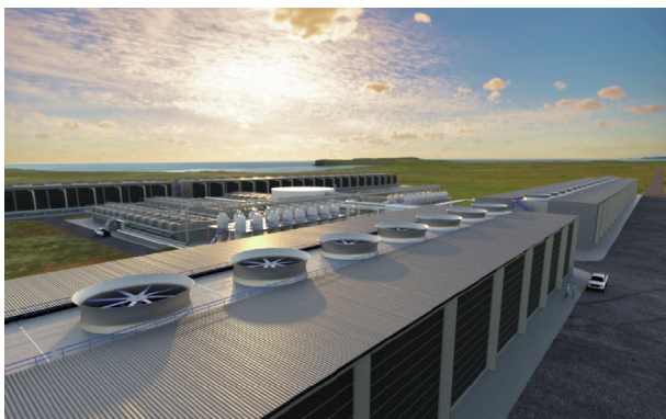
Fig. 2. An artist's illustration of a pilot DAC plant under construction in Squamish, BC, Canada, by Carbon Engineering, a Vancouver, BC, Canada-based decarbonization company that is working to scale up DAC technology into large commercial facilities around the world.