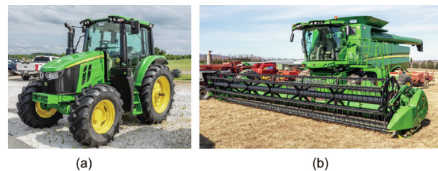
Fig. 1. Farmers using the latest computerized, GPS-guided farm equipment, like this (a) tractor and (b) combine harvester, often cannot access the necessary tools, software, spare parts, and information to make needed repairs themselves. New laws and agreements may make it easier for farmers to perform those repairs or hire independent mechanics.

However, many types of products, including farm machinery, have become harder to repair, often by design. A notorious example is the unorthodox pentalobe screw that Apple began installing on some of its devices in 2009, which requires a specialized screwdriver to remove [16]. Manufacturers have adopted other strategies to curtail who can service their products and what