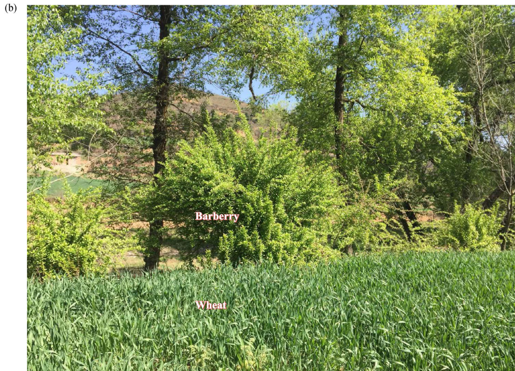
Fig. 1 (a) Simplified life cycle of Puccinia striiformis f. sp. tritici . n (haploid), n+n (dikaryotic), and 2n (diploid). Spores are drawn to approximately the same scale. (b) The phenomenon of wheat and barberry growing adjacent to one another under natural conditions.