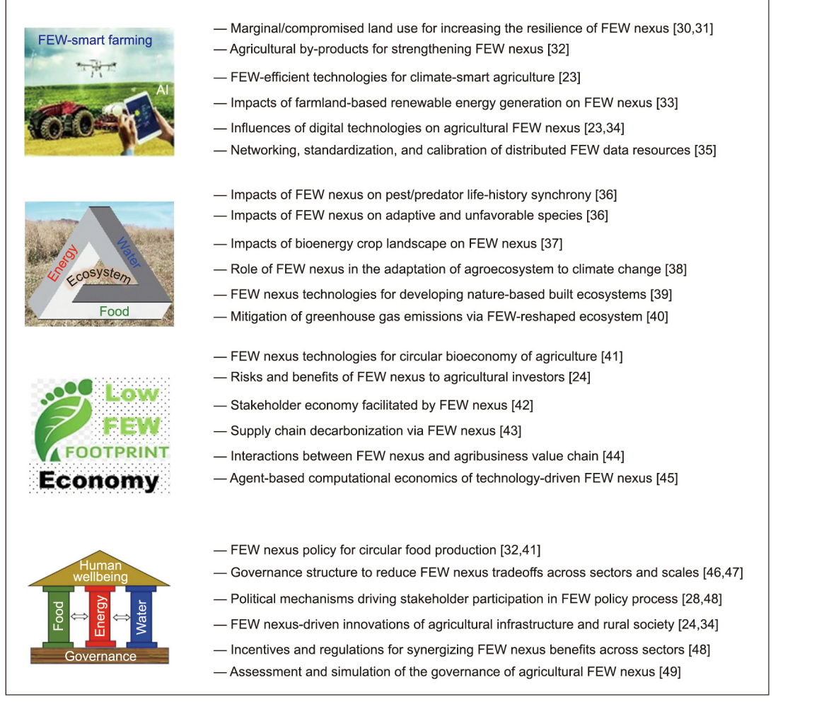
Fig. 1. Research gaps in the agenda of the FEW nexus of agriculture.

predication accuracy. In this case, global sensitivity analyses can help reduce the number of parameters but are still sometimes impractical, due to parameter correlation/distribution and computational complexity. It is thus necessary to develop resolutionhierarchical models across the local to global scales of specific FEW problems. In order to achieve this goal, integrated models should be more scalable and have robust connections while being able to capture major dynamics between local and global models. With more data for a specific local problem, the models can be better calibrated while avoiding overfitting at the global scale.