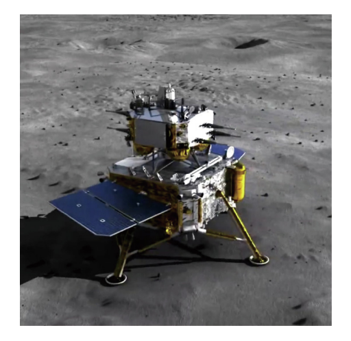
Fig. 2. In an artist's rendition, Chang'e 5's lander and ascent vehicle sit on the lunar surface at their landing site near Mons Rümker. The ascent vehicle carried 1.7 kg of lunar material into orbit and transferred it to Chang'e 5's return capsule for the trip back to Earth.