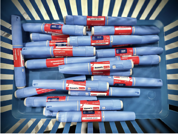
Fig. 1. Ozempic (semaglutide) was approved by the US Food and Drug Administration (FDA) in 2017 for treating patients with type 2 diabetes but its 2021 FDA approval for the treatment of obesity and unprecedented success as a weight loss drug, rebranded as Wegovy, has led to substantially increased demand and shortages.