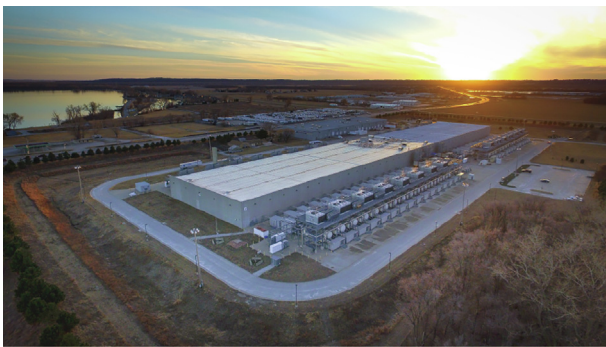
Fig. 2. Large, cloud-accessed data centers like this one built and operated by Google in Council Bluffs, IA, USA, can draw more than 100 MW at any given time—consuming roughly as much electricity as 80 000 homes—and have cooling systems that can guzzle up to 3 \times 10^9 L of water a year. Google claims that all its data centers will be running entirely on renewable energy by 2030.

The environmental toll of AI goes beyond energy. Building data centers and manufacturing computer chips and servers produces greenhouse gases, for instance, and obtaining the raw materials for the electronics entails environmentally damaging mining [25]. Using data from Facebook (Menlo Park, CA, USA), Lee and colleagues estimated in a 2022 report that this so-called embodied carbon (all greenhouse gas emissions not directly connected to data center operation) accounts for between 30% and 70% of the total carbon footprint of certain AI models [26]. And as one article cheekily commented, AI has “a drinking problem,” with data centers requiring large amounts of water to keep cool [27,28]. Ren said that he and his team were the first to try to estimate AI’s water use. Starting with Microsoft’s reported annual water consumption, they estimated that GPT-3—which trained on Microsoft’s cloud computing platform—needed about half a liter of water every time it answered from 20 to 50 user questions [29]. ChatGPT Plus, OpenAI’s updated, faster, and more versatile chatbot that costs 20 USD per month, now relies on an even larger AI model, GPT-4, which is likely to be thirstier. So “overall, our estimate is conservative,” Ren said. Given the 180 million-plus monthly visitors to the ChatGPT website [1], its water consumption could quickly add up to a substantial amount.