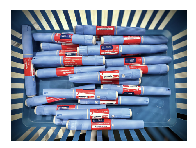
Fig. 1. Ozempic (semaglutide) was approved by the US Food and Drug Administration (FDA) in 2017 for treating patients with type 2 diabetes but its 2021 FDA approval for the treatment of obesity and unprecedented success as a weight loss drug, rebranded as Wegovy, has led to substantially increased demand and shortages.

Oral pill formulations—greatly preferred by patients over injections—of the drugs are also poised to further balloon the market. Both Rybelsus, Novo Nordisk's pill version of semaglutide, as reported in a recently completed phase 3 trial published in an