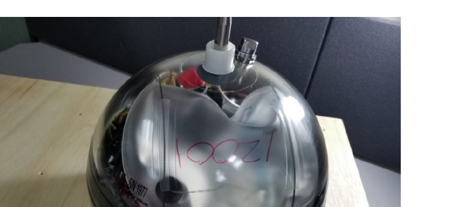
Fig. 3. Deep Argo floats, meant to measure temperature and salinity as deep as 6000 m, have been reengineered with a spherical glass casing to withstand the intense pressures at greater depths.

Another major expansion of the Argo program includes deployment of the BGC floats. More than 450 floats with one or more BGC sensors have been deployed since 2014 via the Southern Ocean Carbon and Climate Observations and Modeling (SOCOM) program and the Global Ocean Biogeochemistry program, both funded by the US National Science Foundation (NSF). The latest floats include up to eight sensors to measure temperature, salinity, pH, oxygen, nitrate, sunlight (downwelling irradiance), chlorophyll (an indicator of ocean plant life), and suspended particles (including macroalgae and bacteria) [15]. Program scientists hope to use these most advanced BGC floats to learn, among other things, how and why the ocean is losing oxygen and to better understand the production of organic carbon by photosynthesis and the biological pumping of that carbon to the deep ocean.