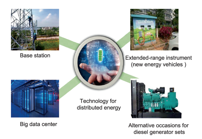
Fig. 2. Primary applications of methanol-based distributed generation technology.

green-methanol-based distributed energy-supply systems, which generate electricity through the reforming of methanol and water, a 5G base station can be adequately powered. Moreover, the power generated through methanol steam-reforming hydrogen fuel cells offers a significant improvement compared with the power from traditional internal combustion engines. The exhaust heat of fuel cells can be efficiently recovered and used for heating in winter and chilling in summer by means of a heat pump. As an example of such potential applications, a single 2.5 kW unit of methanol-reforming hydrogen fuel cells can provide electricity, heating, and cooling for a house. This example highlights the versatility and energy efficiency of this technology for various applications, including both stationary and mobile power systems.