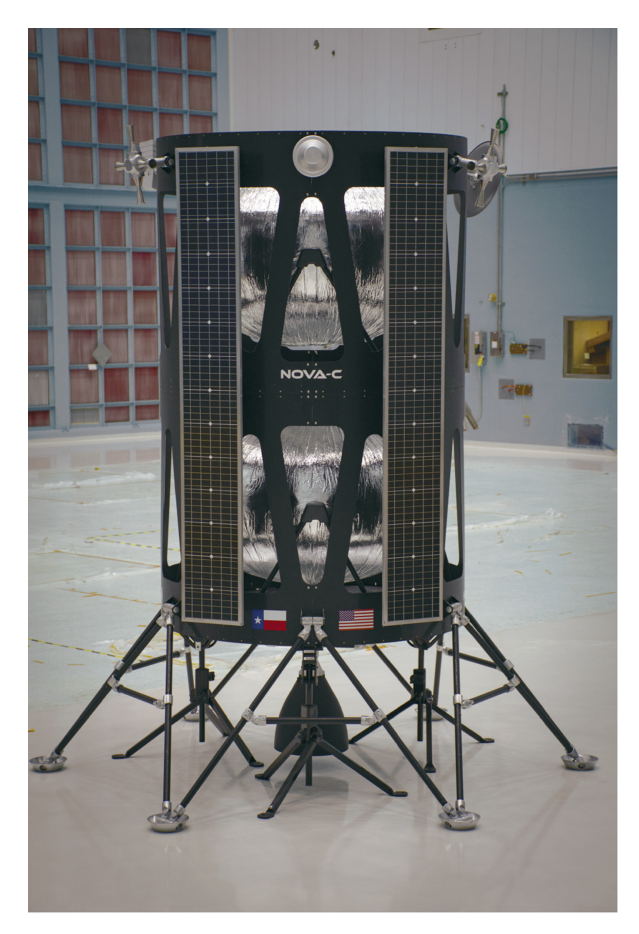
Fig. 2. The Nova-C lander from Intuitive Machines is 3 m tall, 2 m in diameter, and can tote 100 kg of cargo. The craft will carry the Lunar Vertex mission, along with three other government space agency and commercial payloads, to the Moon's surface in 2024. The same model of lander is also booked for two previous missions scheduled to touch down near the Moon's south pole in late 2023.

A main payoff from this approach is that missions are cheaper. For Lunar Vertex, the cost for the instruments, rover, and other necessities for the mission, such as data storage, is 30 million US dollars, said Blewett. Overall, Intuitive Machines was awarded 78 million US dollars from CLPS to provide the lander and cover transportation on the SpaceX rocket [3]; that amount, however, also includes transportation and delivery for three other payloads from government space agencies on the same trip [18]. NASA has not landed any craft on the Moon in 50 years, so making an exact cost comparison is difficult. But the last NASA-designed mission to orbit the Moon, the Lunar Atmosphere and Dust Environment Explorer, which was launched in 2013, cost 280 million US dollars [19].