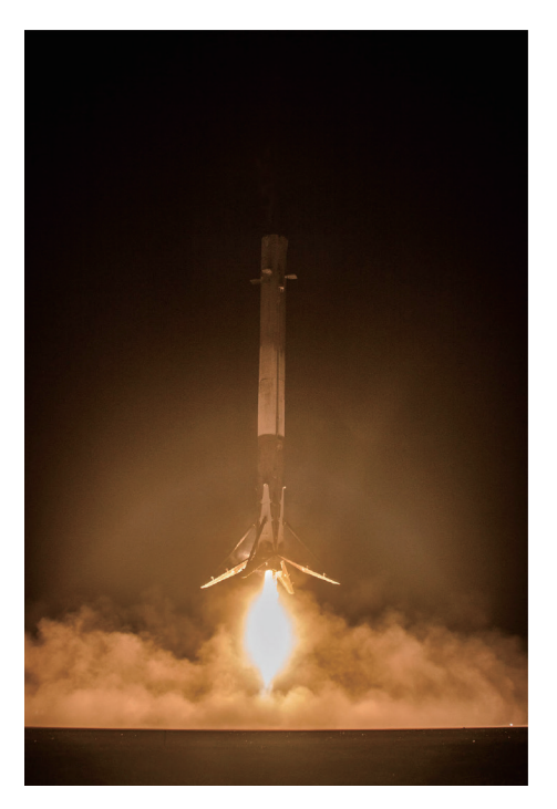
Fig.1. The first stage rocket is shown just prior to touchdown on the launch pad, with support legs deployed at the bottom and grid fins deployed at the top to manipulate direction of lift during reentry.

A landing on an ocean platform requires less fuel to maneuver