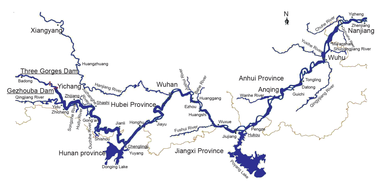
Fig. 3. The Yangtze trunkstream and main tributaries downstream of the Three Gorges Dam.

Chenglingji reach was reduced to a certain extent, with the scouring quantity making up 38.5%; the scouring intensity in the Chenglingji-Hukou reach was increased, with a scouring quantity accounting for 61.5%, showing that the scouring intensity in the channel obviously developed downstream.