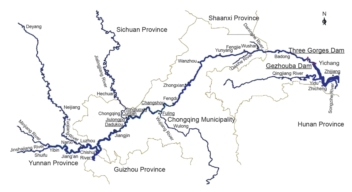
Fig. 2. The Yangtze trunkstream and main tributaries upstream of the Three Gorges Dam.

The Three Gorges Reservoir Area is historically prone to geological disasters. After the construction of the TGP began, the national government set up a special fund to take structural protection measures against geological disasters in the reservoir area. Structural treatment of 428 landslides and 302 unstable reservoir banks has eliminated harm from collapses and landslides