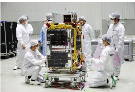
Fig. 2. Astroscale’s space debris removal spacecraft, shown here, consists of a 175 kg, mini-fridge-sized servicing satellite armed with a magnet and a second smaller 3 kg client satellite perched on top. The project aims to test the ability of the bigger satellite to chase and magnetically capture the smaller one. Once conjoined, the two satellites will eventually deorbit and harmlessly burn up in the Earth’s atmosphere.

In May 2021, the European Space Agency (ESA) enlisted Swiss startup ClearSpace (Renes, Switzerland) to reel in a 2.4 m, cone-