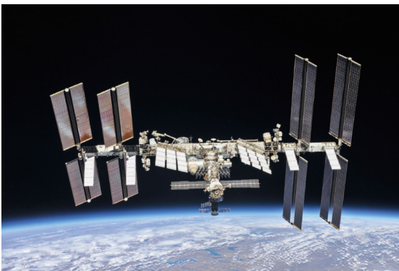
Fig. 1. Debris generated from the collision between a Russian anti-satellite missile and a Soviet-era satellite triggered an emergency response aboard the ISS, shown here in an artist's depiction, with the seven astronauts living in the station sheltering in a pair of attached spacecraft for 2 h.

The US Department of Defense currently tracks 27 000 debris shards in orbit [13], while millions of untrackable fragments of